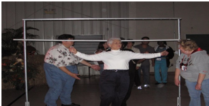
“We’re Off Our Rockers!”

Legal Services: Paralegal available by appointment only, must call 349-1088. Insurance counseling through Seniors Health Insurance Information Program (SHIIP).